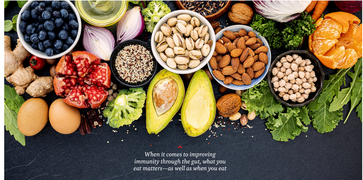
When it comes to improving immunity through the gut, what you eat matters—as well as when you eat

Improving immunity through the gut The gut offers an attractive pathway to influence disease response and health. “Anything that you put into your mouth and you ingest into your body is going to have an opportunity to interact with the microbiota,” says Howitt.